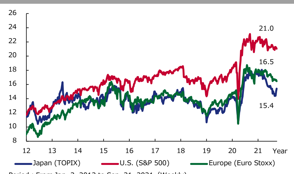
Figure 4 : Comparison of market PER in US, Europe and Japan

Period: From Jan. 3, 2012 to Sep. 21, 2021 (Weekly)